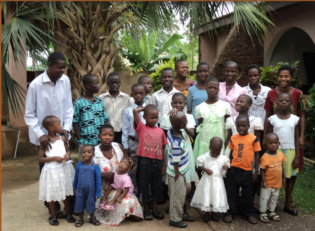
The Interim Houseparents and their children in a group picture with the children