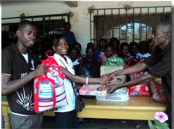
The Administra- tor receives food items donated to the Home by UCC Medical students