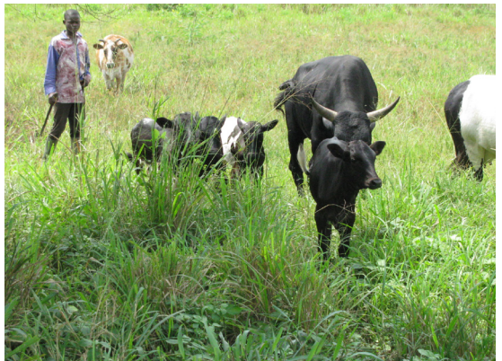
Corn crop and cattle on the farmland in Ghana.