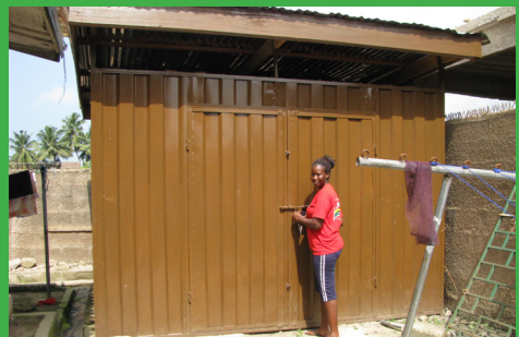
New storage container at the home.