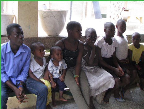
Children excited to receive their gifts.