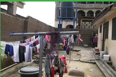
Wash day at the childrens home.