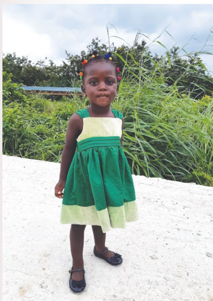
Three months into the care and protection business, she has transformed totally.

The child in the first week of admission was given a thorough medical screening both at the