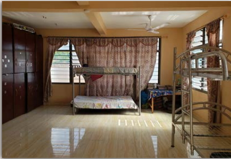
A bedroom at the home where each child has their own bed and closet.

basic education and have been reunified to my family. I'm now very hopeful for life outside the home more especially because even though I had a Muslim background, I have accepted the Lord Jesus as my personal savior also serving in His vineyard as a sound engineer in my church.