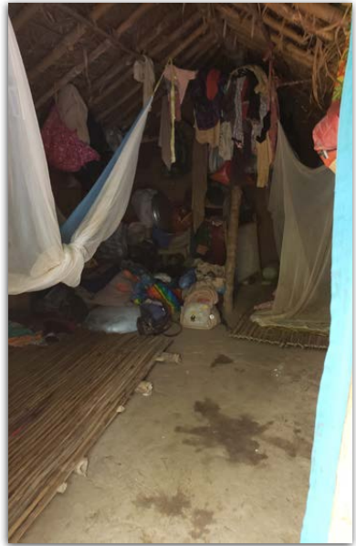
Inside a one-room mudhut where the entire family would sleep and store their belongings.